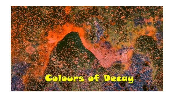
Honourable Mention FIAP Ribbon