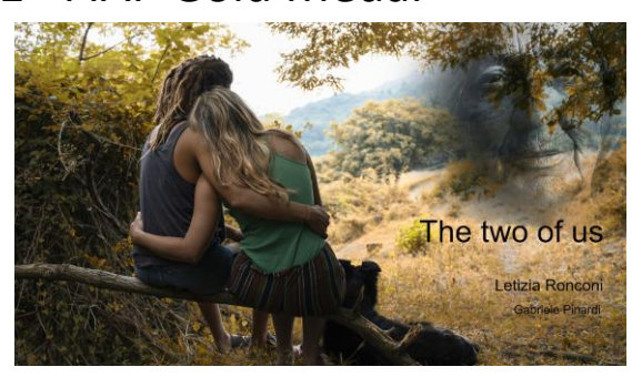
1st FIAP Gold Medal