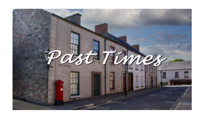
3rd PAGB Bronze Medal