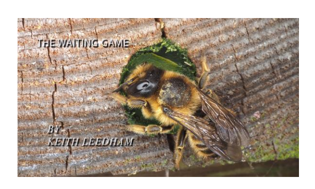
3rd PAGB Bronze Medal