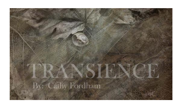
Honourable Mention FIAP Ribbon