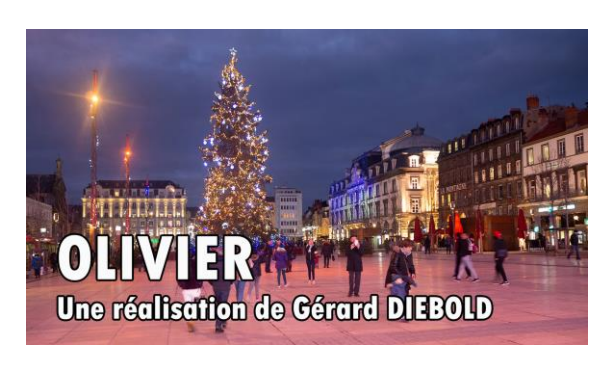
2<sup>nd</sup> PAGB Silver Medal