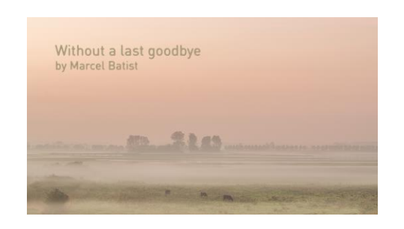
Honourable Mention FIAP Ribbon