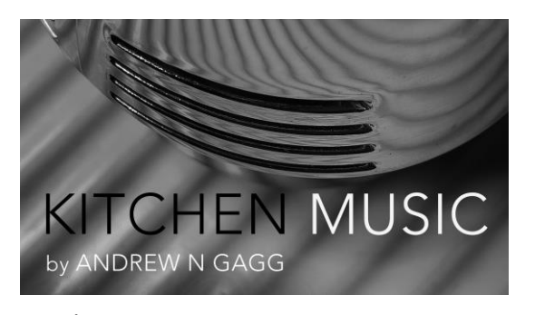
1st FIAP Gold Medal