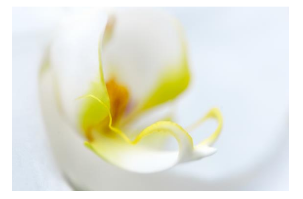
2<sup>nd</sup> PAGB Silver Medal